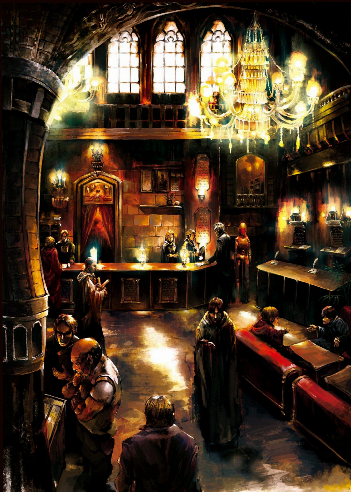
illustration by so-bin

OVERLORD [5] The men in the Kingdom Figane Maugama